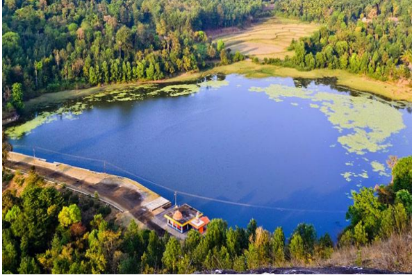
Fig 2:- Topography of Bellandur Lake