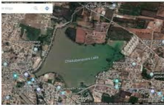
Fig 5:- Topography of Madikeri Lake