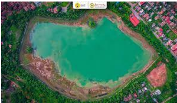
Fig 4- Topography of Udupi Lake